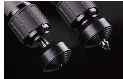
2-WAY Leg Tip (rubber and spike)