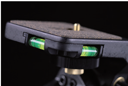
Dual axis bubble level