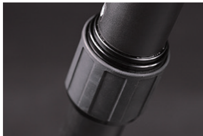
T.L. Leg Lock Type