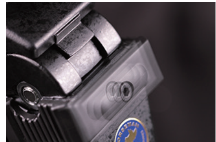
3-Position leg angle